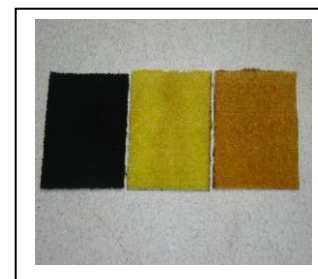
Anti-microbial coating applied on carpet